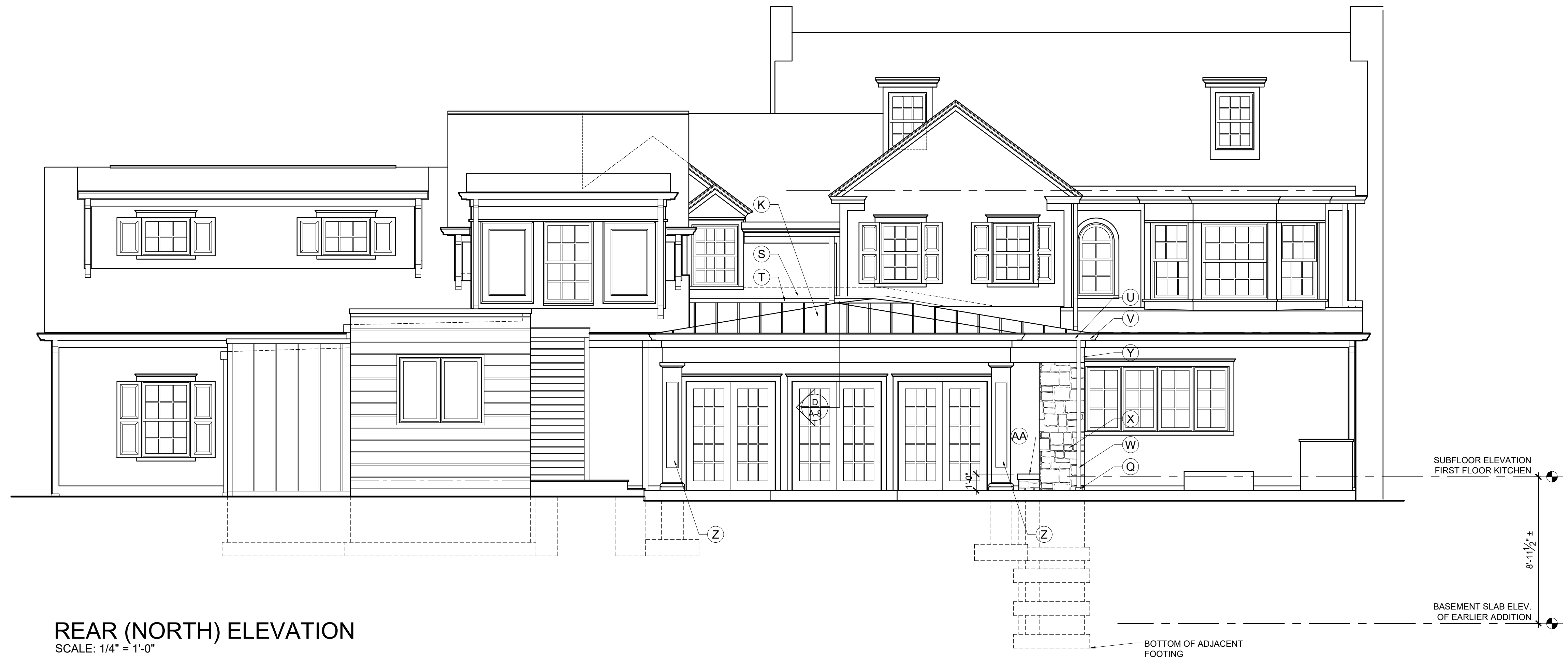
REAR (NORTH) ELEVATION SCALE: 1/4" = 1'-0"