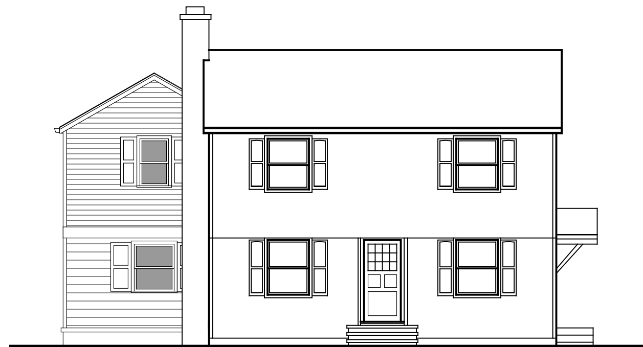
WEST (FRONT) ELEVATION