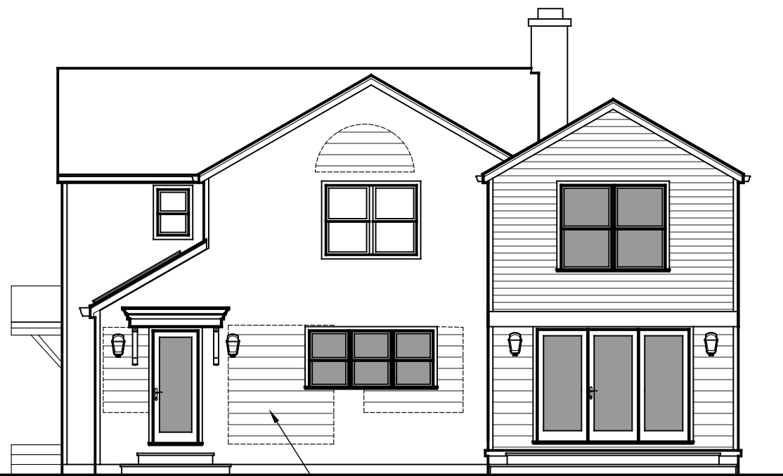
EAST (REAR) ELEVATION

REPAIR AREAS WITH VINYL SIDING TO MATCH EXISTING