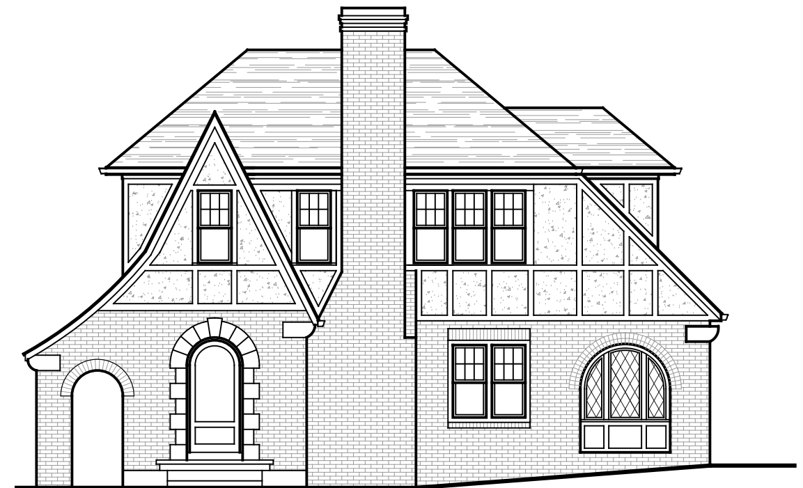
EAST ELEVATION NO WORK THIS ELEVATION

LAUERHASS ARCHITECTURE, LLC ALL RIGHTS RESERVED.