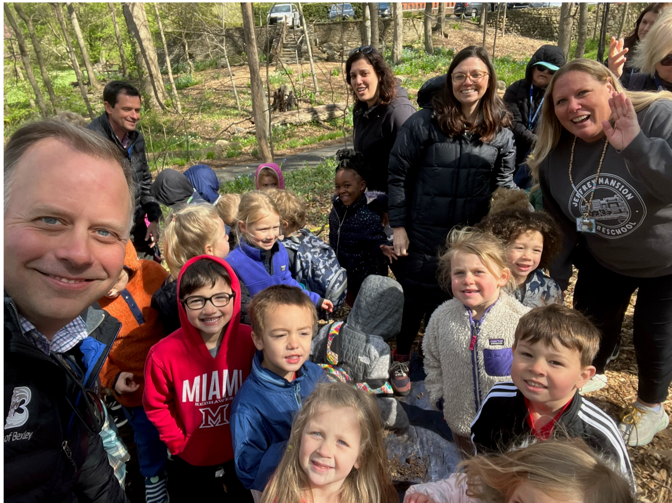
Tree planting with Jeffrey Mansion Preschool