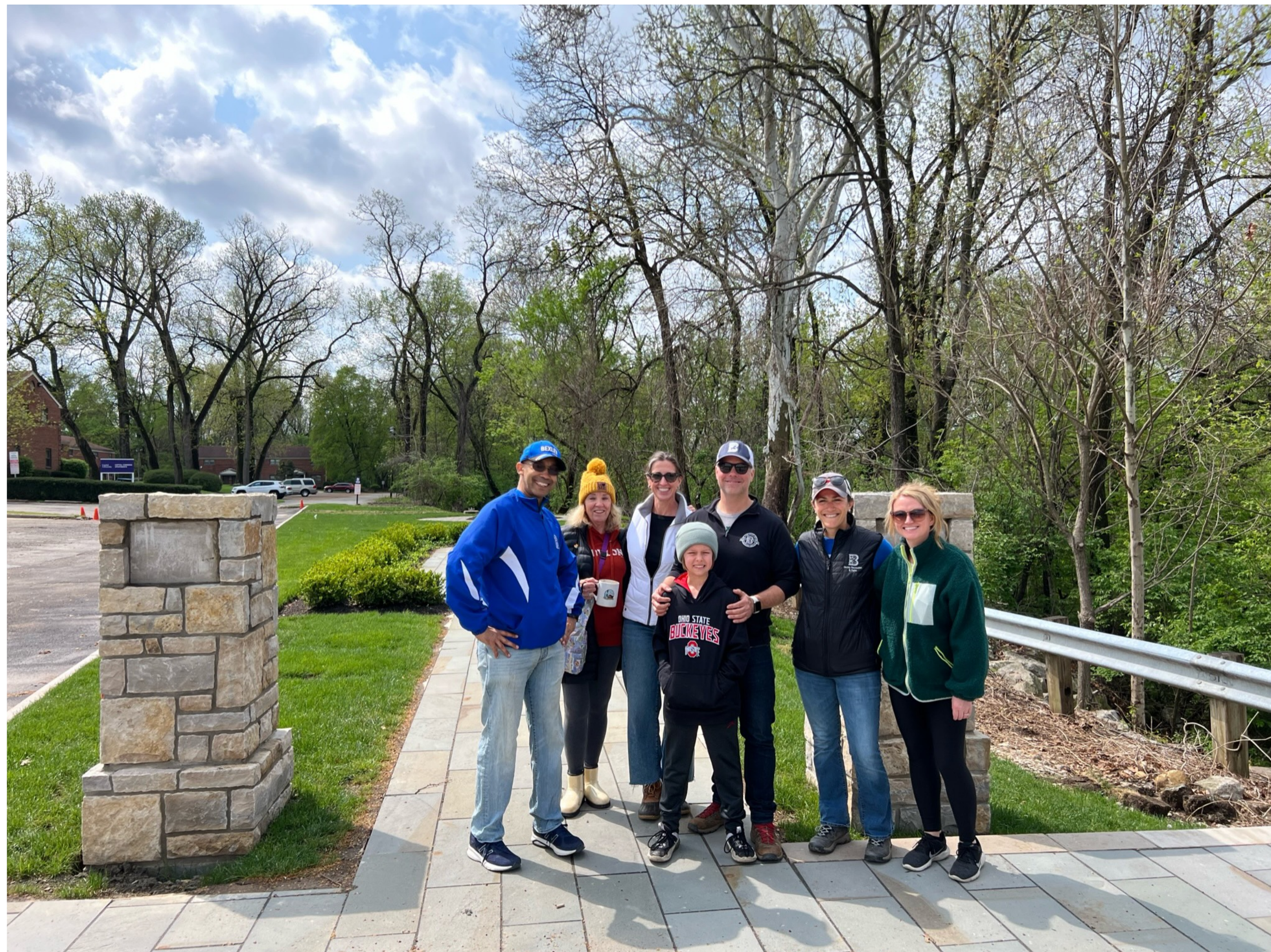
Schneider Park walk and talk