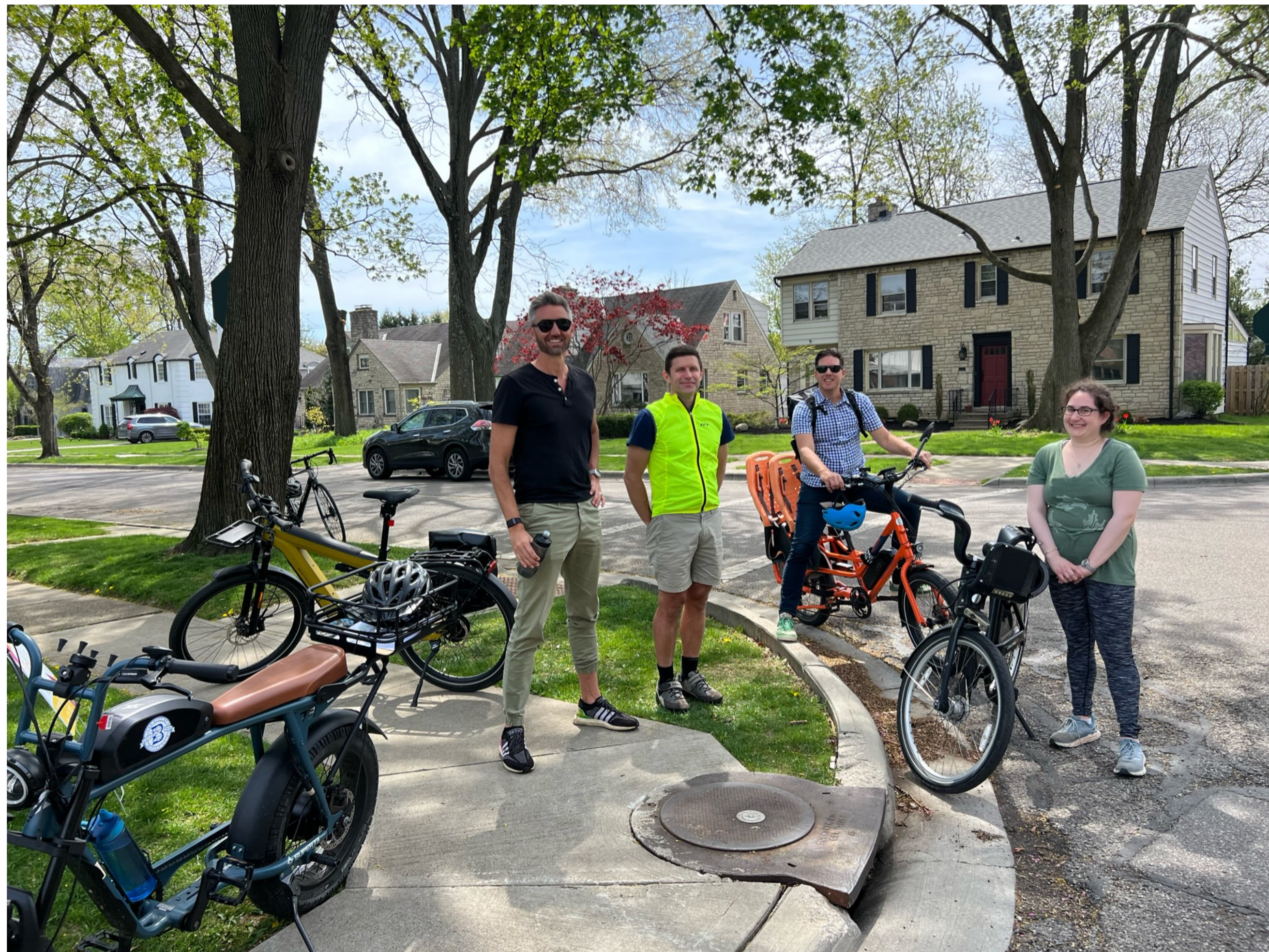
Calm Corridors bike-along tour