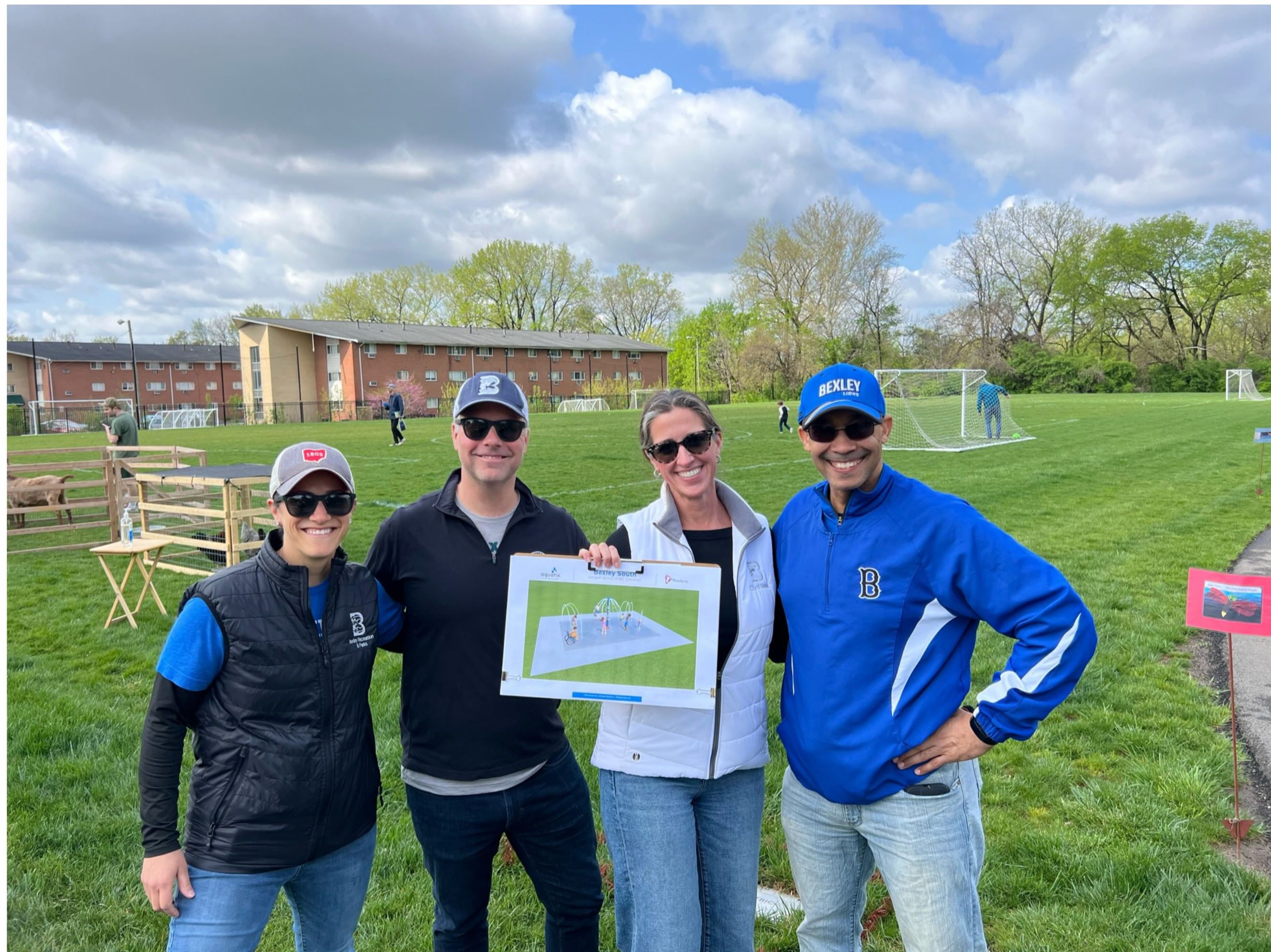
Schneider Park walk and talk