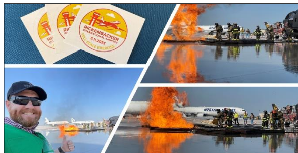
Pictured Above: EP Planner (Curtis Feland) next to a plane crash firefighting simulator used at the 2025 Rickenbacker full-scale exercise; logo stickers for full-scale exercise seen top left